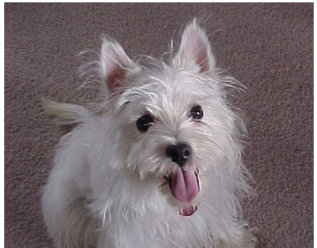
In Memory of Goober : 6/21/00 — 7/19/01